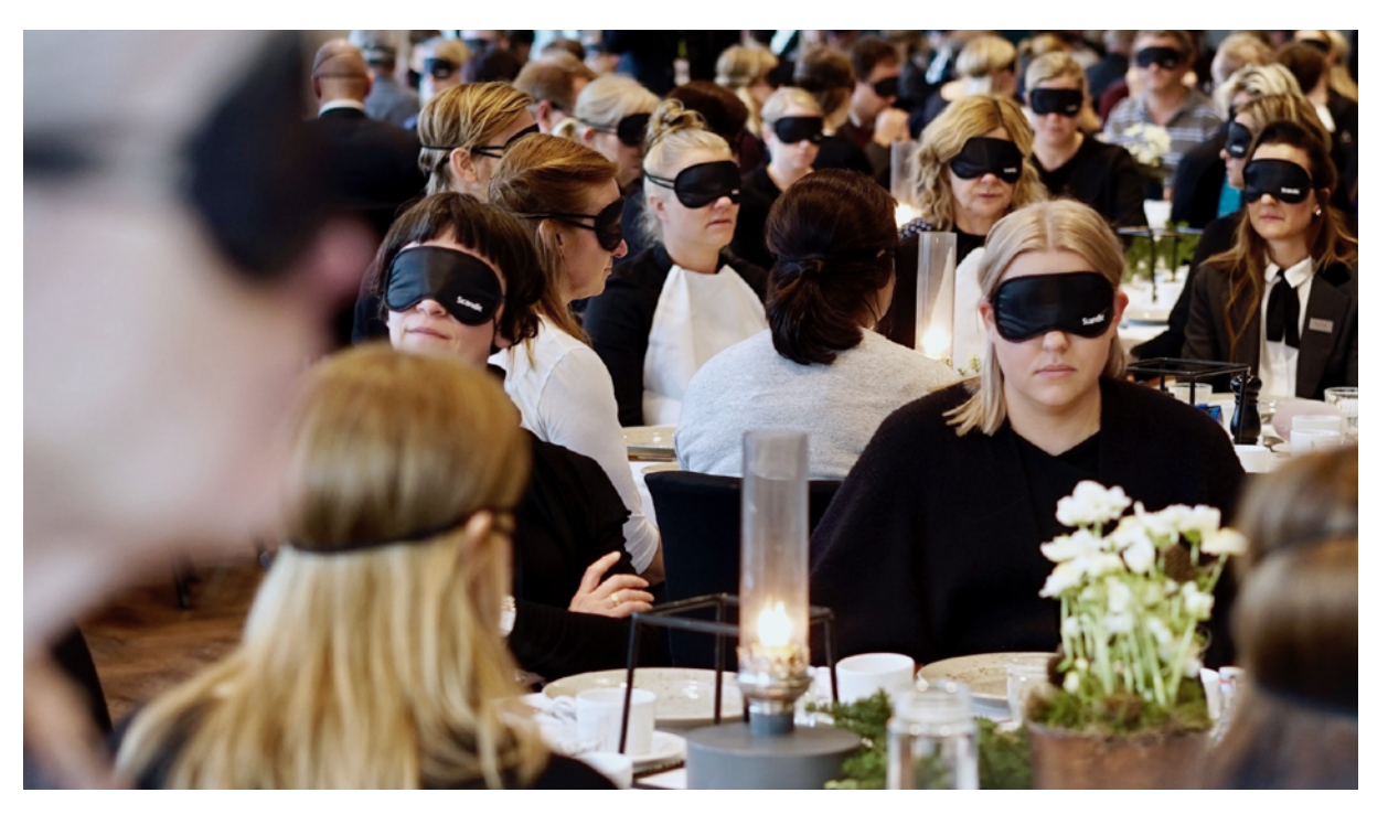
Blind lunch at Scandic. With the help of the senses other than your eyes, such as hearing, smell and taste, gives a better understanding of disabilitie and how we should respond and serve a person with impaired vision.